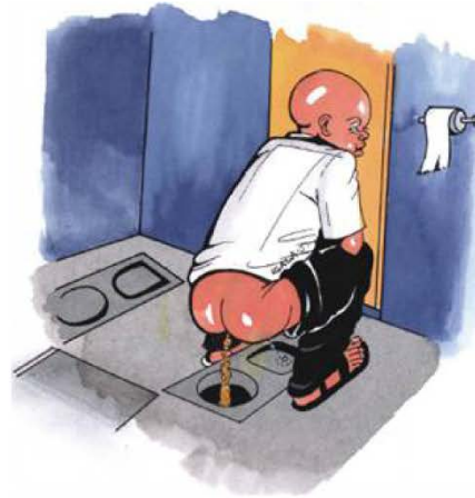
SQUAT & AIM AT HOLE