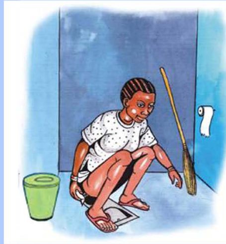
SQUAT & AIM AT HOLE