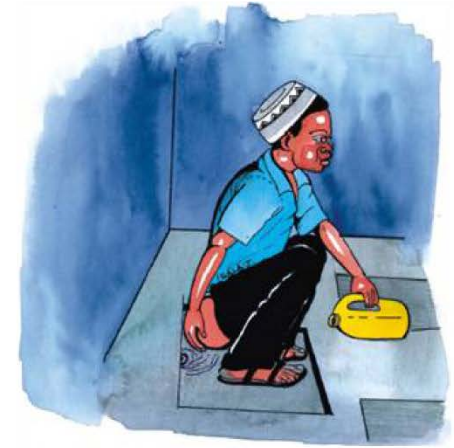
WASH BOTTOM OVER SQUAT HOLE OR DEPOSIT PAPER IN WASTE BIN