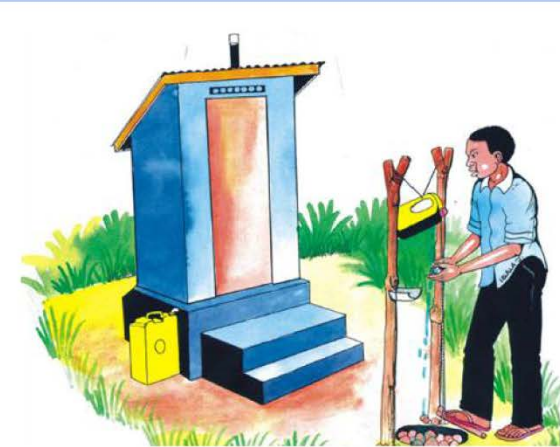
WASH HANDS WITH SOAP AND WATER