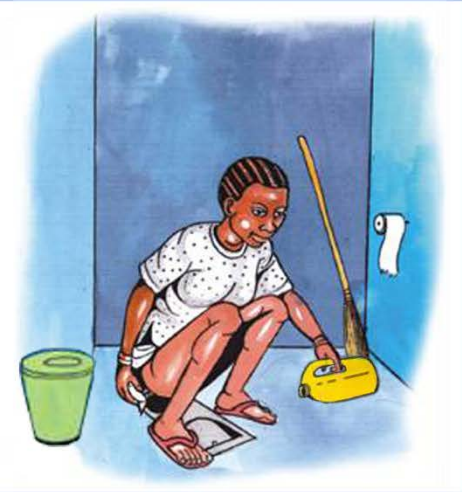
WASH BOTTOM OVER HOLE. DEPOSIT ALL PAPER OR CLOTH IN WASTE BIN.