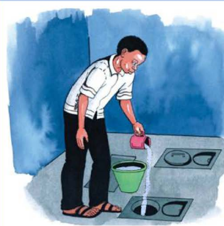
POUR WATER TO FLUSH TOILET