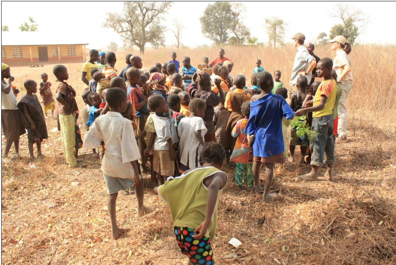
In this picture, we are discussing the siting of the future sanitation block

In January 2012, we held a workshop with the school children of Taha. We asked their help in planning a toilet block for the school.