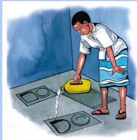
POUR WATER TO FLUSH TOILET